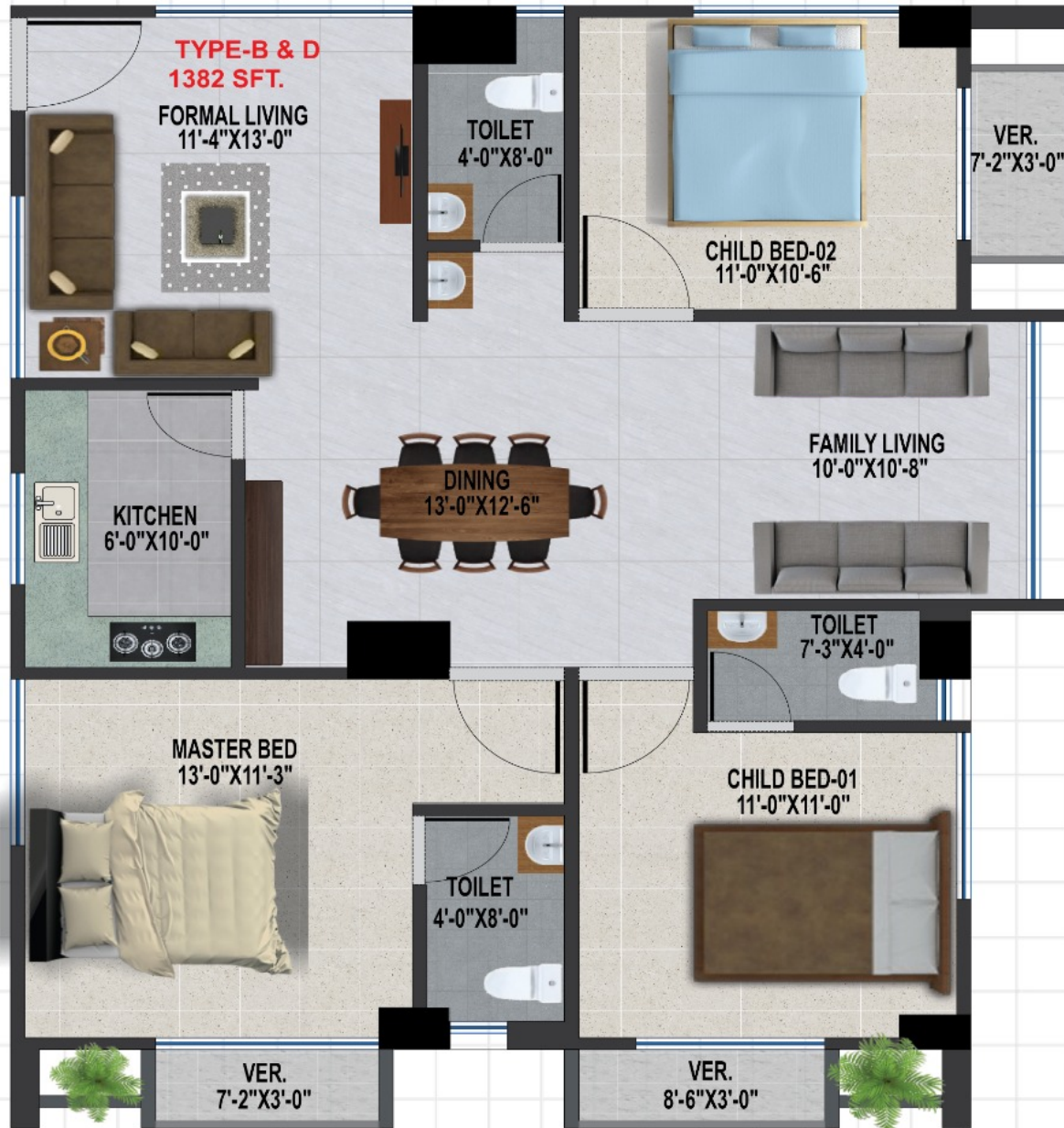
FLOOR PLAN TYPE-B & D